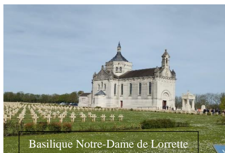
Basilique Notre-Dame de Lorette