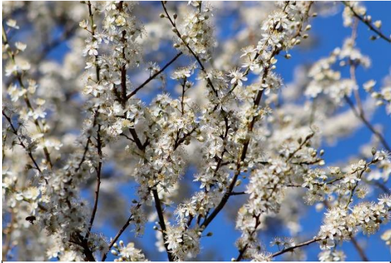
Blackthorn blossom: Contes hedgerow

“♪ Now is the Month of May, Fa-la-la ... ♪”