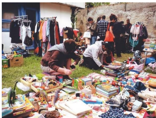
Just the thing for my granddaughter!