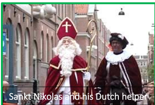
Sankt Nikolas and his Dutch helper

The importance of all this is obvious: in this frantic run-up to Christmas, many retailers do almost as much business as in the rest of the year combined.