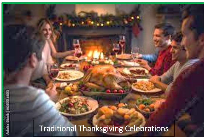
Traditional Thanksgiving Celebrations

It's that time of year again! The next few weeks are marked by a variety of celebration dates in the build-up to the supreme festival of Christmas. In fact, in this part of France, the first signs of the festive season were spotted as early as September with displays of Christmas decorations in a local supermarket!