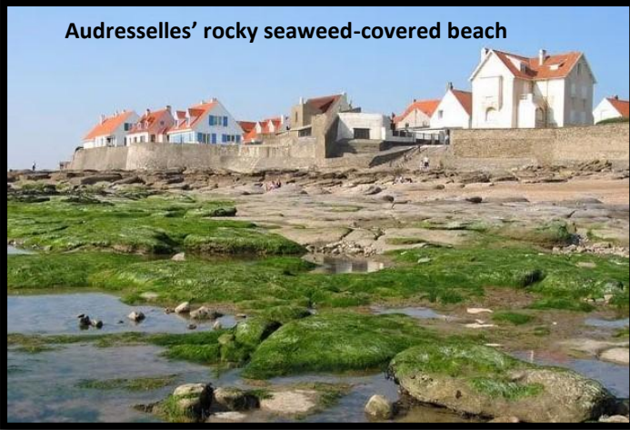
Audresselles' rocky seaweed-covered beach

As we all know, we are very fortunate to have so many interesting local and natural history associations in our region; on top of all the cultural and artistic events that go on throughout the year.