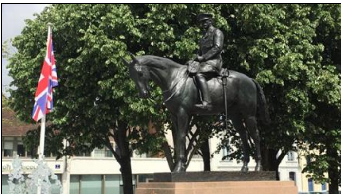
Equestrian statue of Field Marshal Douglas Haig in Montreuil-sur-Mer

Haig has been judged harshly by some historians; but it is noteworthy that after the war Haig devoted himself tirelessly to the rehabilitation of ex-servicemen and their families. He launched the Haig Poppy Fund to raise funds for unemployed veterans and those damaged by the war; and to alleviate the suffering of a generation of war widows. He founded the Royal British Legion, which celebrated its