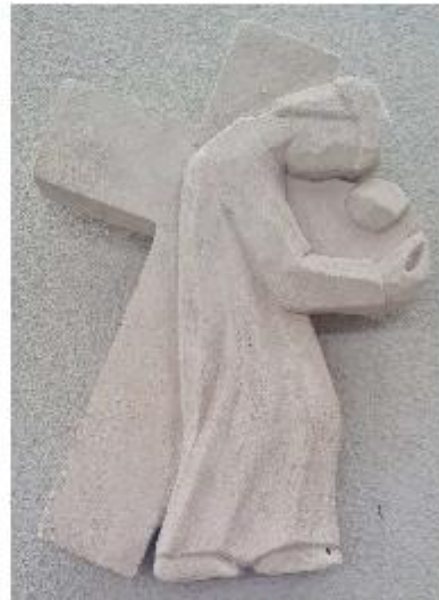
Maison diocésaine d'Amiens

(suivie d'un bol de soupe offert, repas tiré du sac)