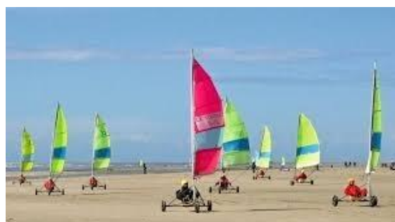
Catching the wind on that wide-open beach

Under an initiative by the Municipality and local Tourist Office a campaign was launched to create a week-long programme of events and activities designed to display the town's attractions to the full and to attract English visitors back again. Local businesses, hotels, restaurants, sports associations and other attractions were encouraged to support and participate in the initiative.