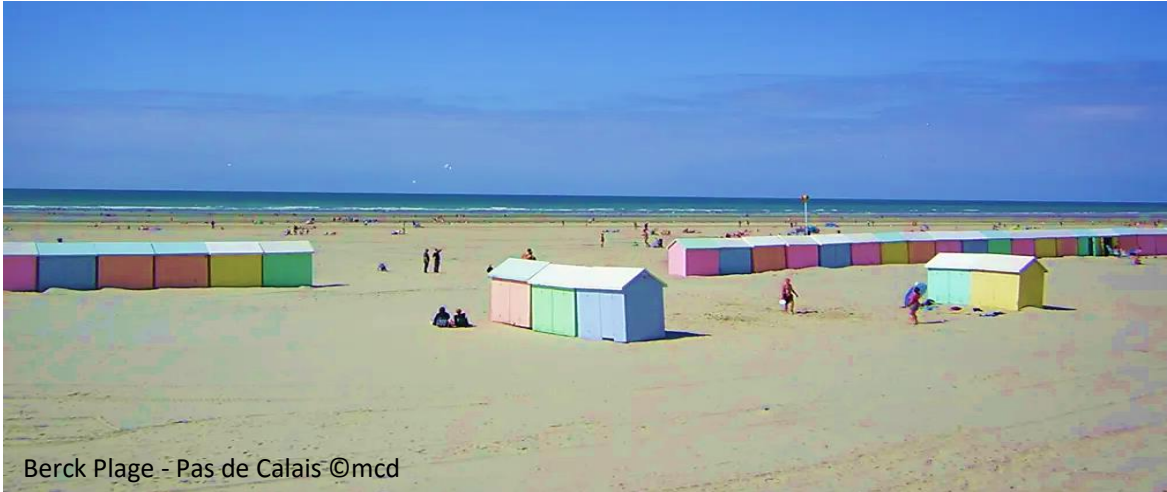
Berck Plage - Pas de Calais

Summer time begins on Sun, Jun 21, 2026 – Wed, Sep 23, 2026