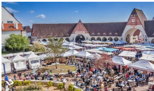
Le Touquet's famous covered market

Le Touquet has been a popular holiday destination for the British and the French ever since it was